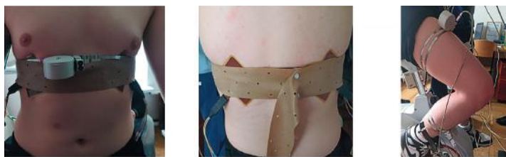
Figure 5 – Location of electrodes on the chest (front and back view) and on the lower limb.

It should be noted that the rheographic method is known. In particular, it is widely used in clinical practice to study blood circulation in hard-to-reach areas of the body and organs. V. A. Karelin (1957) first used this method to assess the state of peripheral blood circulation in obliterating arterial diseases. V.A. Karelin designated peripheral rheography with the term «rheovasography». Scientists of the Bogomoletz