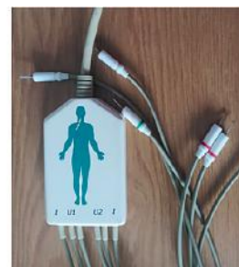
Figure 2 – 8-channel computer diagnostic complex «ReoCom XAI-Medika».