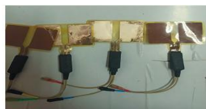
Figure 3 – Tape coil electrode for thoracic rheography and rheography of the lower limbs (left) and double flat electrodes for rheography of the liver and spleen (right).