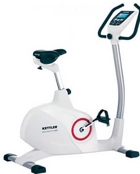
Figure 1 – Bicycle ergometer: KETTLER Ergometer E3.

Simultaneous fixation of hemodynamics in the described organs during physical exertion is quite important. As our observations revealed,