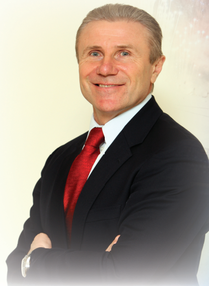
SERGEY BUBKA IOC Executive Board Member, IAAF Vice President, NOC of Ukraine President

The unique world of Olympism will appeal to you! Let the Olympic flame, lit in legendary Olympia, and which has travelled to the cities hosting the Olympic Games, ignite goodness, mutual respect, peace, friendship and beauty in your heart!